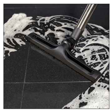
Clean, Dry Floors Again and Again