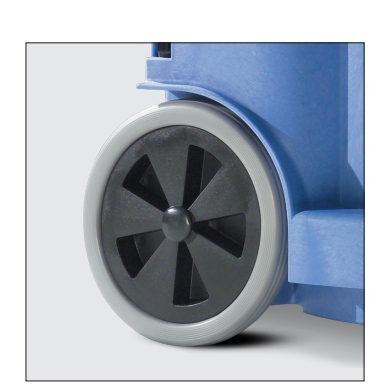
Large Rear Wheels for Ease of Transit