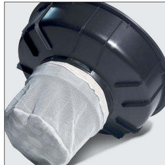
Safety Net Filter and Float Assembly