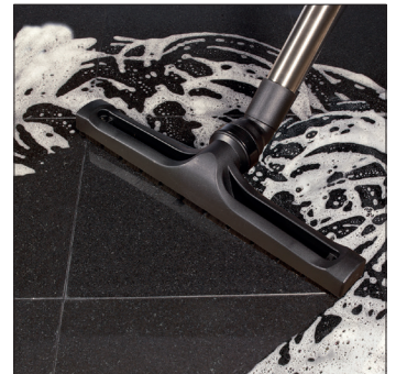
400mm Wet Pick-up Nozzle