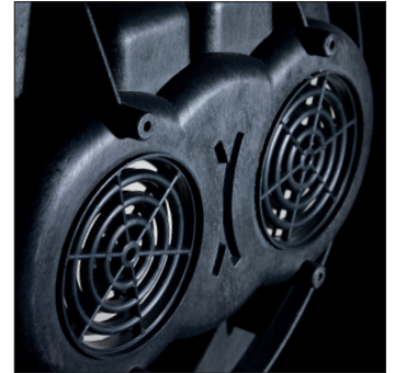
Twin Motor Power Option