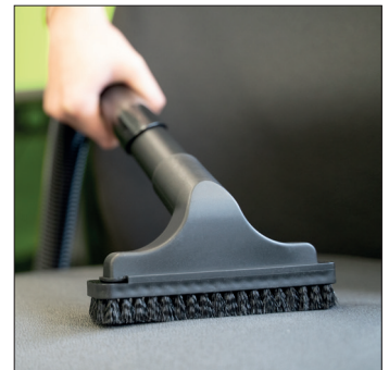
Upholstery Brush Tool