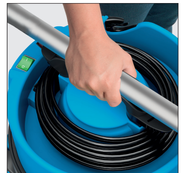
Easy to Transport with Carry Handle