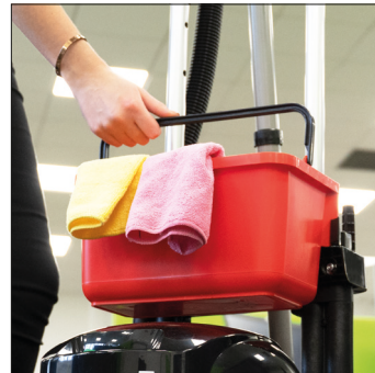
Swing and Lift-off Caddy System