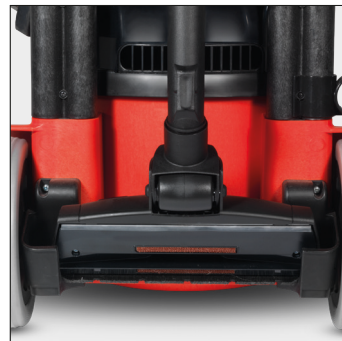
PPT Safe and Secure Docking System