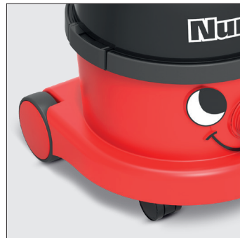
Heavy-duty Tough Bumper