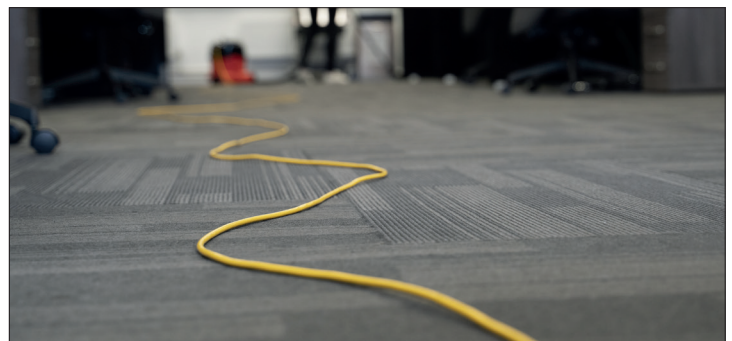
Long 12.5m Hi-Vis Cable