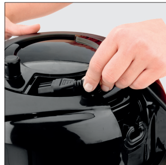
Plugged Cable System