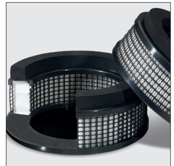
H13 HEPA Filtration Module (EN1822)