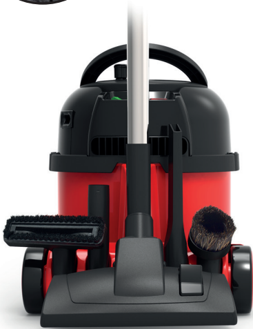
On-board Tool Storage