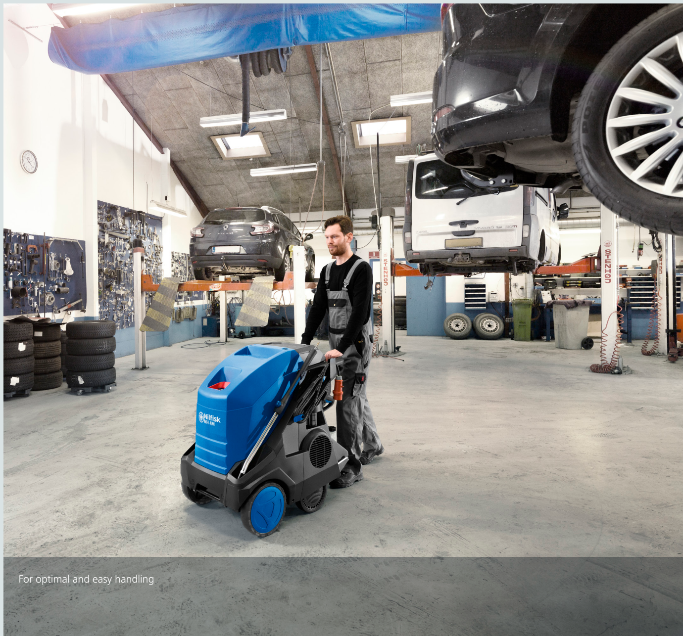
For optimal and easy handling

The 4 wheel concept with larger wheel diameter and sweight balance mean that the MH 3M and 4M models provide optimal manoeuvrability over all types of surface – reducing the effort needed by the user to reach their cleaning site.