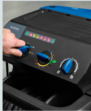
Control panel with safety indications.