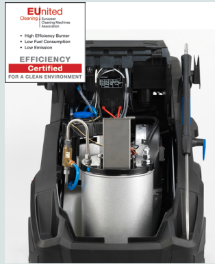
The EcoPower boiler provides high efficiency and low fuel consumption – approved by EUnited.