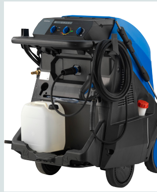
All key functions placed for optimal ease-of-use.