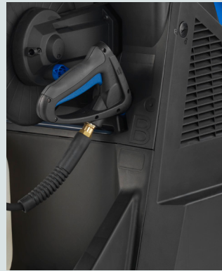
Unique holder prevents spray gun from falling on the ground when the washer is used or moved.

The 4 wheel concept with larger wheel diameter and sweight balance mean that the MH 3M and 4M models provide optimal manoeuvrability over all types of surface – reducing the effort needed by the user to reach their cleaning site.