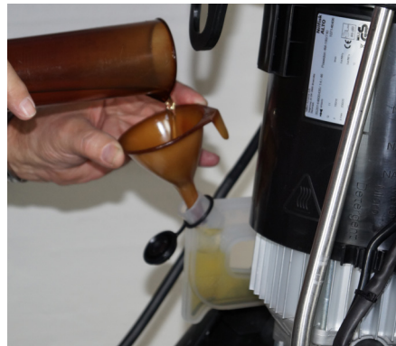
Pump oil tank with oil level sight and fill/empty function.