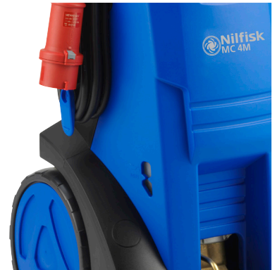
The turnable cable hook makes winding and unwinding of the electrical cable child's play.