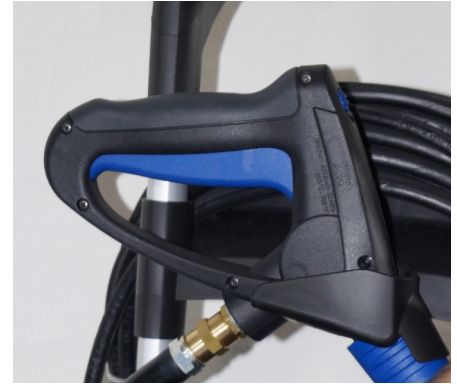
Unique patented Spray Gun Holder protects the gun from falling on the ground and being dragged behind the machine – preventing damage.