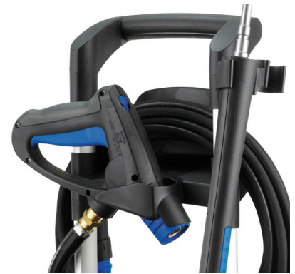
Unique patented Spray Gun Holder protects the gun from falling on the ground and being dragged behind the machine – preventing damage.

MC 3C is designed for light, general cleaning tasks and is the ideal choice for tradesmen, small building companies, small garages and farms.