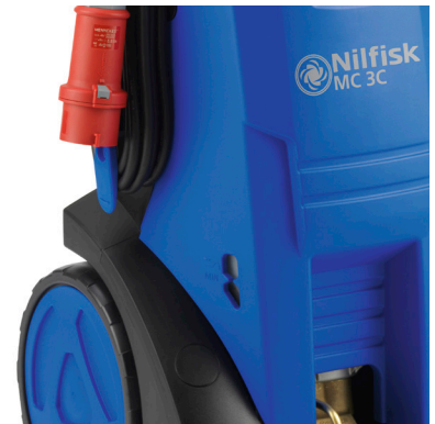
The turnable cable hook makes winding and unwinding of the electrical cable child's play.