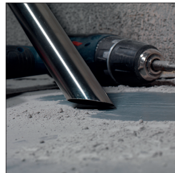
Stainless Steel Gulper / Scraper Tool