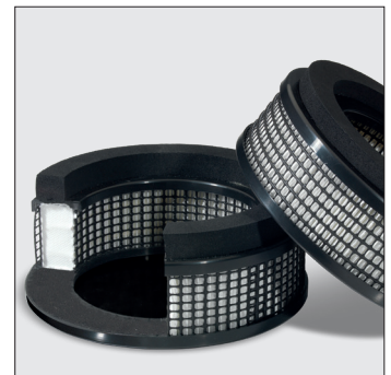
H13 HEPA Filtration Module (EN1822)