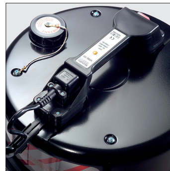
Plugged Easy Cable Change

High-efficiency, triple-layer, giant MicroFlo multi-stage dust bags for fine dust collection.