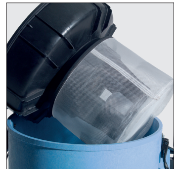
Wet and Dry System