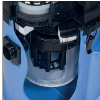
Unique Filter System