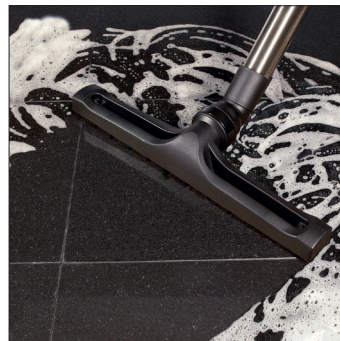
Clean, Dry Floors Again and Again