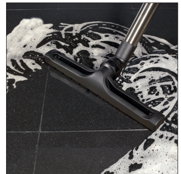
Clean, Dry Floors Again and Again