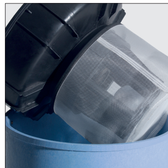
Wet and Dry System