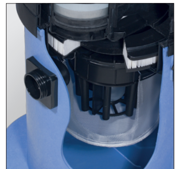
Unique Filter System