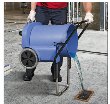
Tipper Handle for Clean Emptying