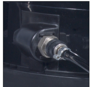
Quick Release Cleaning Liquid Connector