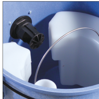
Tank within a Tank