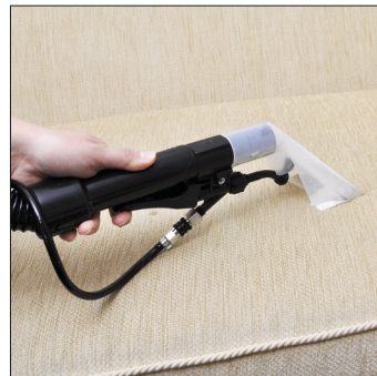
Handheld Upholstery and Stair Tool